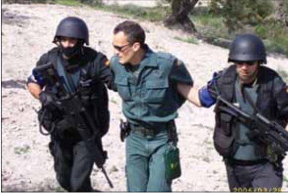
Euro-Gendarmerie exercise (Torquil Dick-Erickson. 1984 to come true soon? timesofthesigns.wordpress.com )

It is envisaged that the well-armed Euro-Gendarmerie may be used in various 'trouble spots' and 'post-conflict' zones all over the world. The Gendarmerie may also be used to suppress civil disorder in EU member-states in the future.