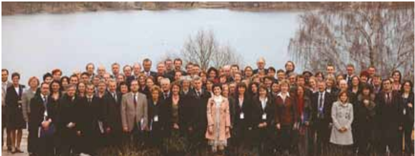
An EJN meeting – a photograph from an EJN brochure. www.ejn-crimjust.europa.eu

Yet, it is not very clear who exactly the 'contact points' are. The EU Council Decision, which is the legal basis of the EJN, only provides that the EJN shall consist ' of the central authorities responsible for international judicial cooperation and the judicial or other competent authorities with specific responsibilities within the context of international cooperation ' and that