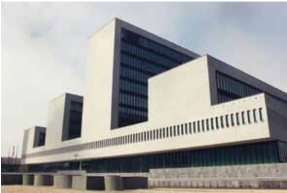
Europol headquarters in the Hague

Europol employs over 700 staff, who enjoy immunity from prosecution or civil lawsuits in relation to everything they do or say as Europol officers, with just one technical exception (if a Europol officer takes part in a Joint Investigative Team between member-states, his actions as a member of JIT are not covered).