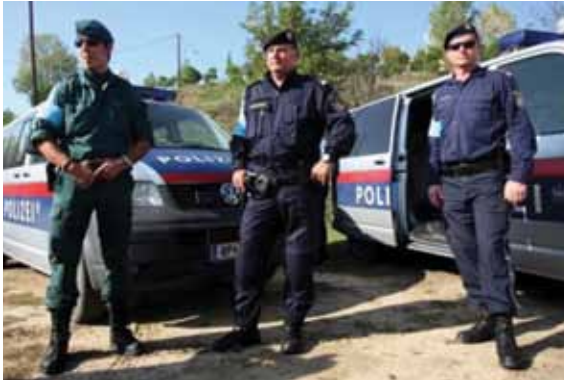
FRONTEX Rabit-s officers deployed near Greek-Turkish border

Frontex is the Warsaw-based EU's agency for 'external border security', created in 2005. It has about 20 of its own airplanes, about 30 helicopters, well over 100 sea vessels, and its own network of border patrols at sea. Since 2007, Frontex includes a rapidly deployable border-guard force – rapid border intervention teams (Rabit-s) – which can be used to protect the EU from any threat of large-scale illegal migration. In 2010, the first Rabit-s force was deployed on the Greek-Turkish border.