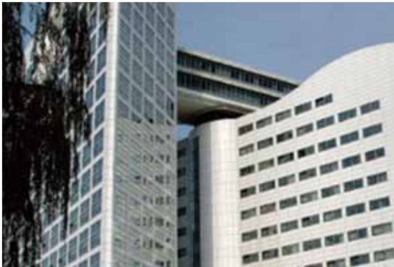
Eurojust headquarters in the Hague

Eurojust represents an unprecedented concentration of judicial and police power in Europe. At this level, there is no mutual independence, no separation of powers, no checks and balances between judges, prosecutors and the police. Between themselves, members of Eurojust can exercise those enormous powers all over the European Union. Safeguards are few and weak, and the citizen is left almost entirely defenceless to a potential abuse of that power.